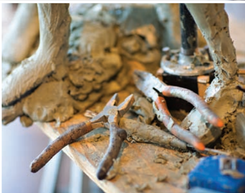
The artist's tools.

"I'm a storyteller, an American, and I have to tell the story of us," he says. "I'm not sure where that leads me, but it's what I have to do." SA