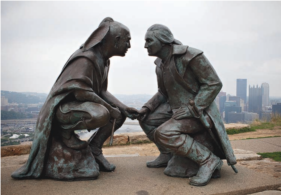
Erected on Mt. Washington in 2006, West's Point of View quickly became an iconic symbol of Pittsburgh.

The resulting home for his muse is a huge open space. Window-paned garage doors let in light, while also giving bucolic views of the river. Except for some lawn around the patios and a few flowers, West has left nature to design the landscape. At strategic places inside are drafting boards and stands for modeling in clay.